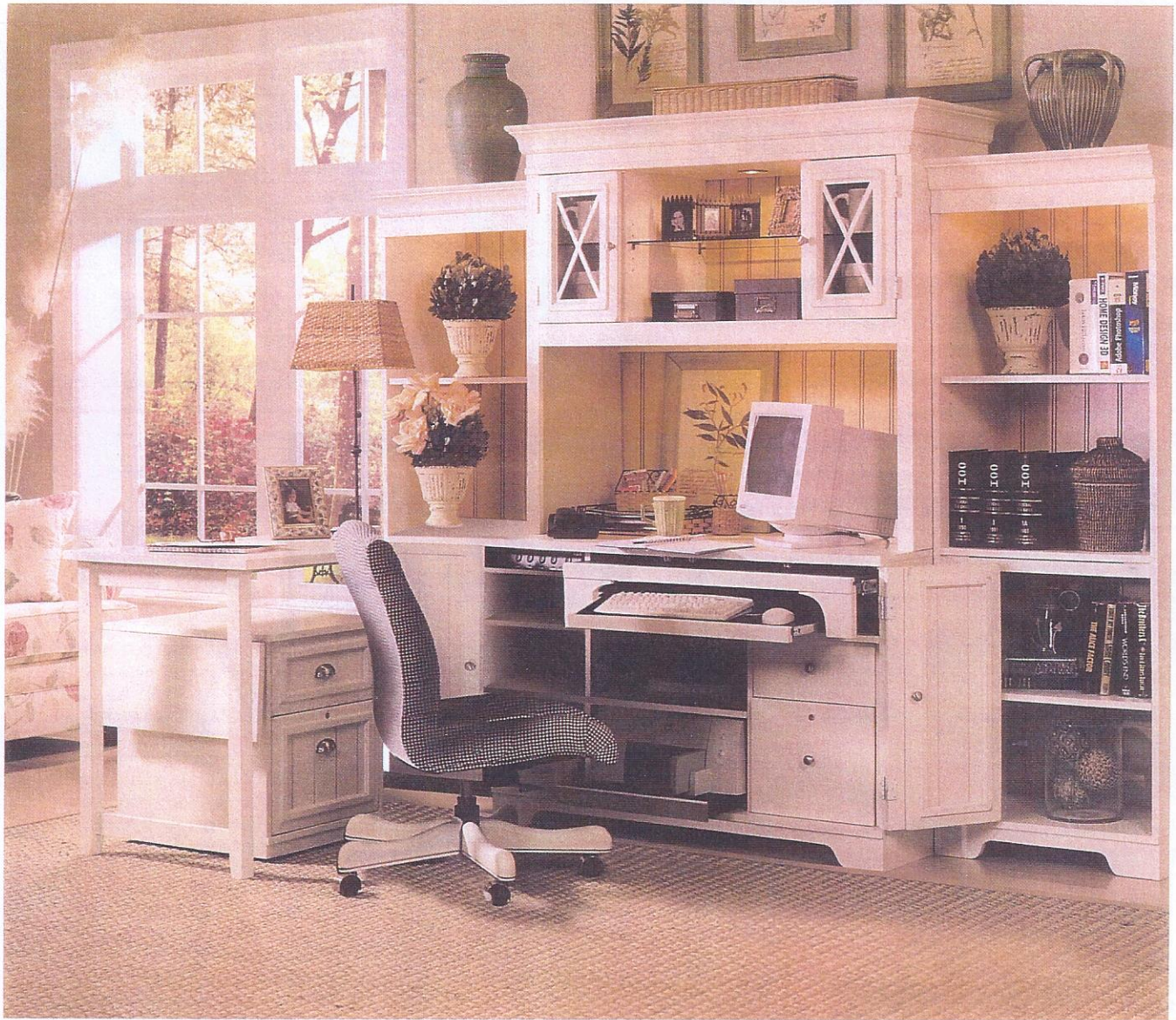
This Hooker Furniture computer station blends with traditional interiors.

a designer- writer offers solutions for where to place the computer