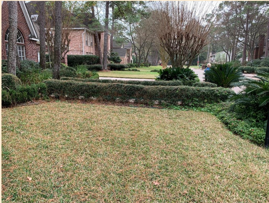
EXISTING: SIDE VIEW

Removal of the hedges creates a more expansive view and simplifies lawn maintenance. As this vista shows, the front yard is now similar in appearance to neighboring yards, creating a cohesive environment.