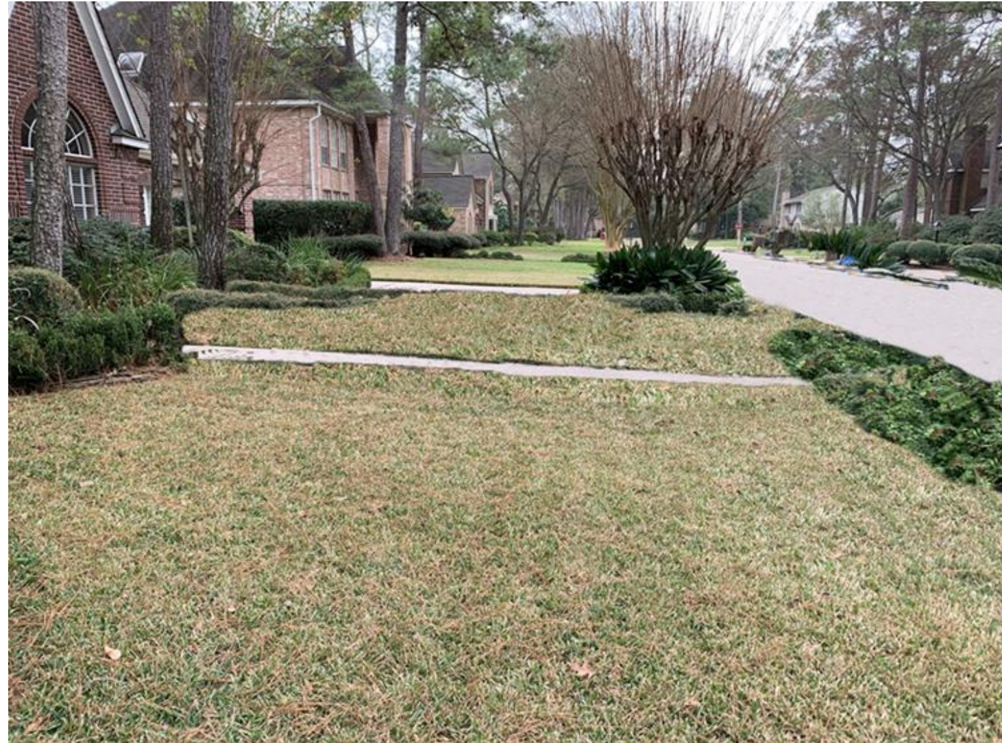
PROPOSED: SIDE VIEW