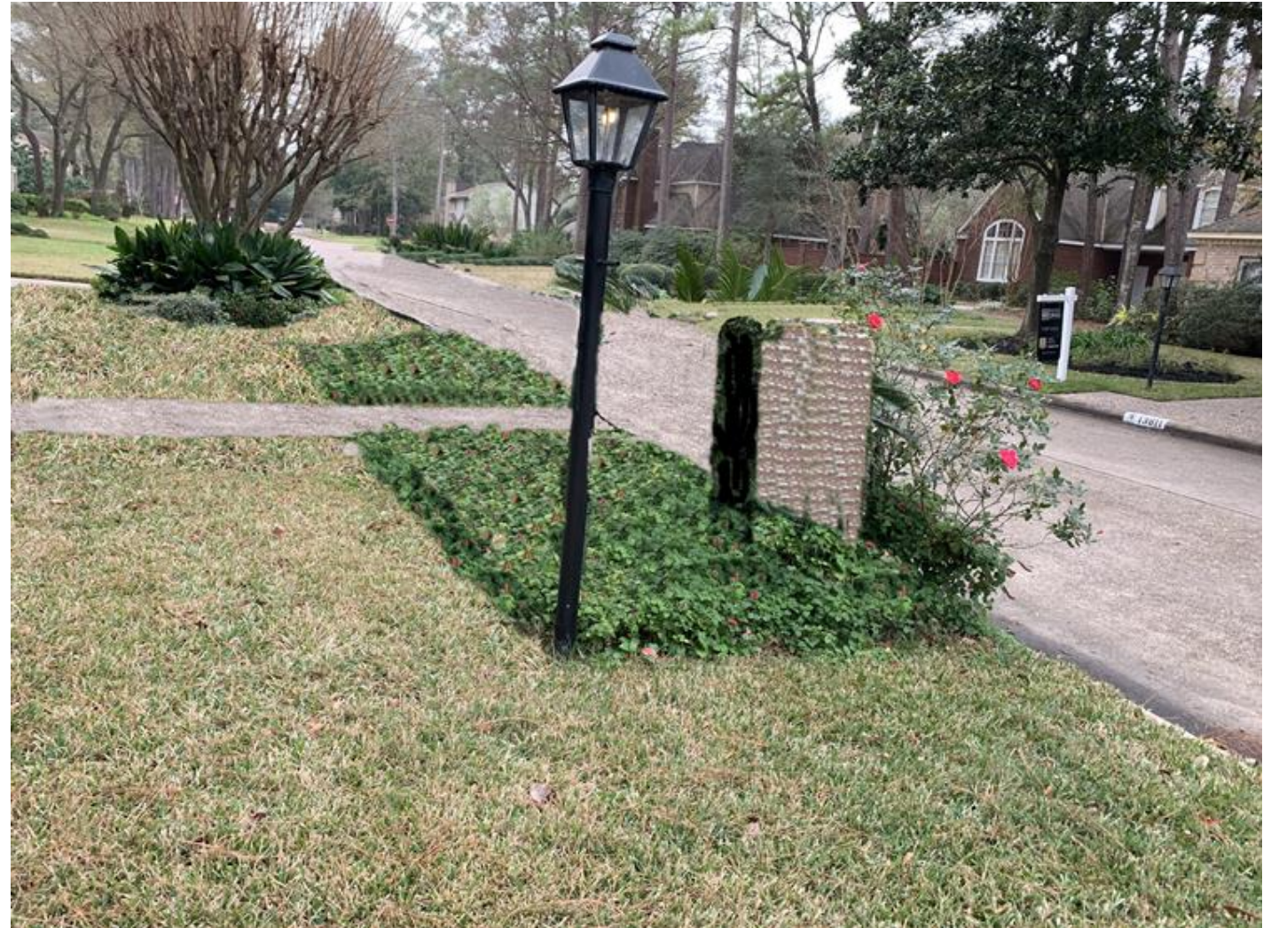
PROPOSED: GAS LIGHT VIEW